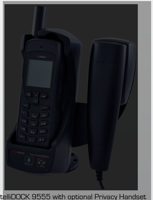
IntelliDOCK 9555 with optional Privacy Handset