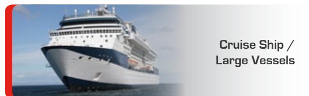
Cruise Ship / Large Vessels