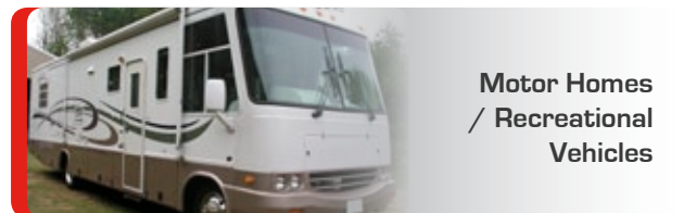
Motor Homes / Recreational Vehicles