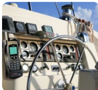
Beam SatDOCK, In-Vessel Application