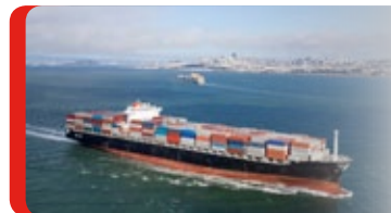
Cargo Vessel / Captain & Crew Calling