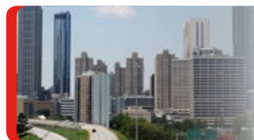
In-building, Fixed Site Applications