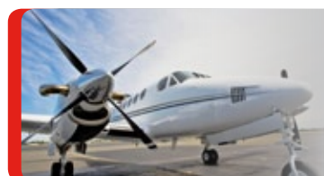
Light Aircraft & Helicopter