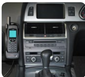
SatDOCK 9555 In-Vehicle Application